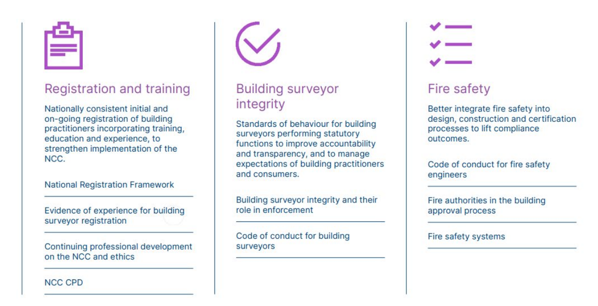
Figure 1 – Building Confidence Implementation Framework – Outputs

The ultimate aim of the Framework is to help ensure that building products are used in a way that complies with the NCC.